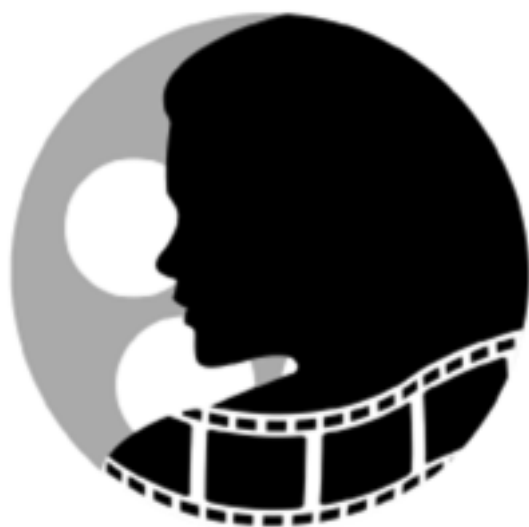
Women in Cinema