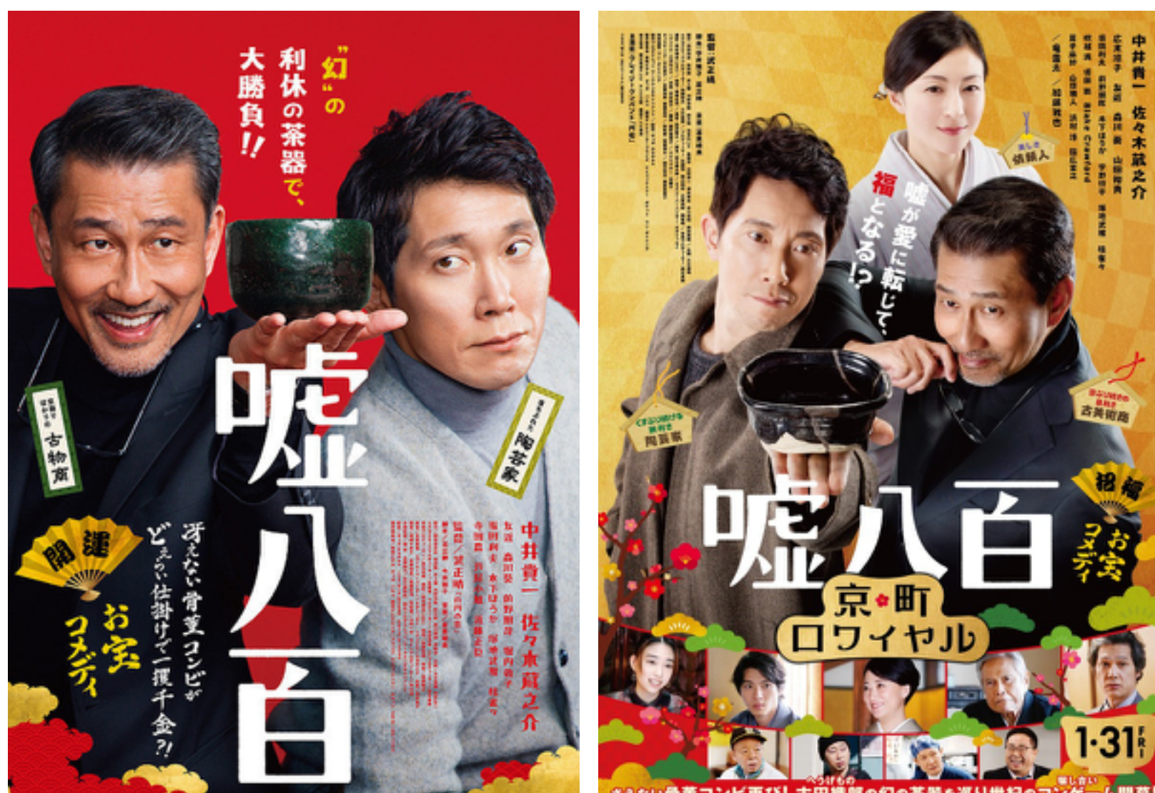
Images: © 2018 "We Make Antiques!" Film Partners, 2020 "We Make Antiques! Kyoto Rendezvous" Film Partners