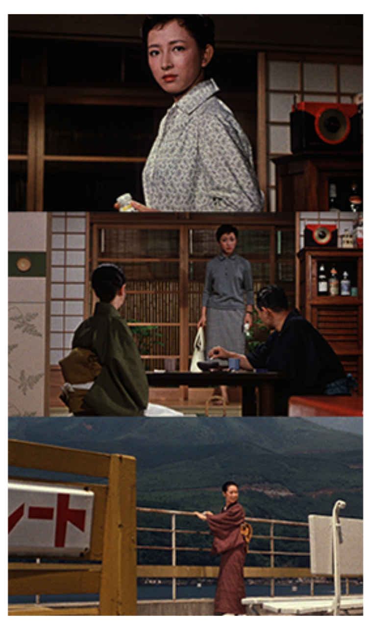
REGISTER FOR TICKETS

For additional questions or to modify your reservation, contact us at jicc@ws.mofa.go.jp. Your registration is not transferable.